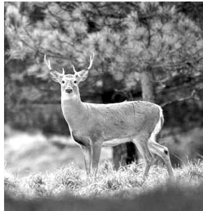
The goal of the DNR since the late 1980s has been a smaller, healthier deer herd with a higher percentage of antlered bucks.

Out-of-season killing of deer, illegal kill, and "gut shooting" were reduced by providing opportunities to take deer with block permits during the regular season.