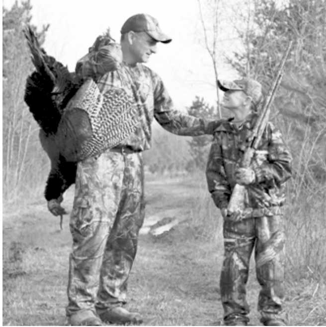
Caption: Michigan turkey hunting has reached unprecedented success thanks to effective management practices.

There was a time in Michigan when turkeys were very plentiful. However, unregulated harvest and loss of habitat made them all but vanish in the Great Lakes State. Many efforts to re-establish the population were made from the early twentieth century through the 1980's including mimicking habitats found in the successful Pennsylvania turkey management program and relocating birds from Iowa and Missouri.