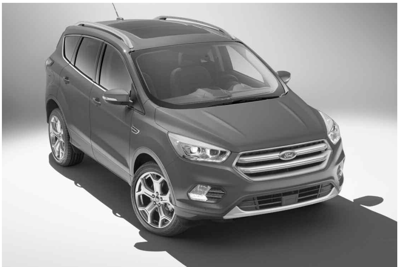
Ford Escape Titanium The new Ford Escape gives Compact SUV drivers a fresh, fun-to-drive option redesigned from the inside out and packed with technology. Titanium model shown in Ruby Red Metallic.